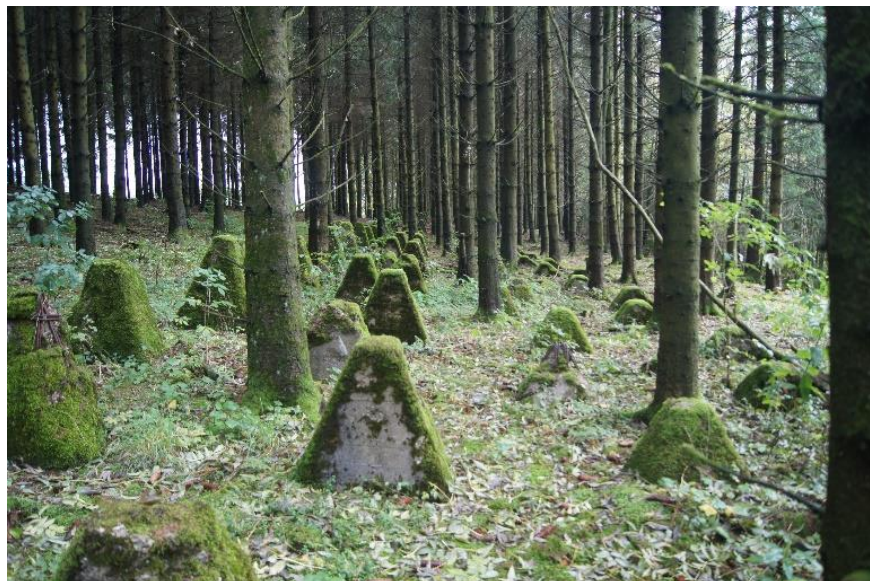
The West Wall's tank traps provide an evocative starting location.

Day 7—Saturday, 18 September—Bus will depart Hotel Reiff for BRU at 05h30. Because the drive is approx. 2.5 hours, we anticipate arriving at BRU at 08h00. This should give participants time to catch a 10h00 or later flight. However, we caution that things can go wrong (traffic, accidents, protests, etc.), and Knee Deep Into History Battlefield Tours LLC assumes no responsibility for delays.