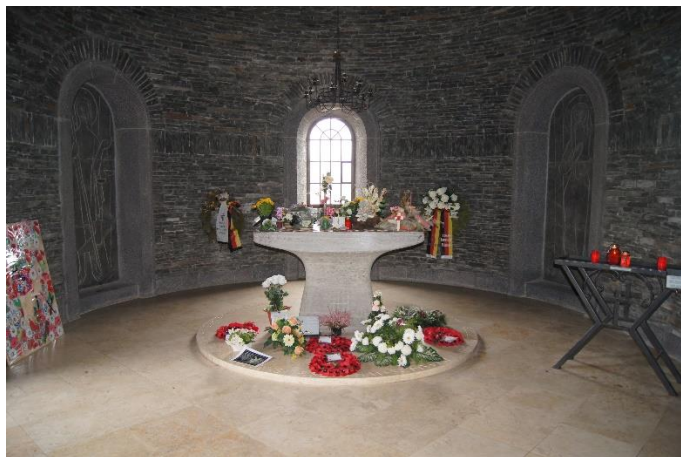
Interior of the Chapel at German Military Cemetery Recogne