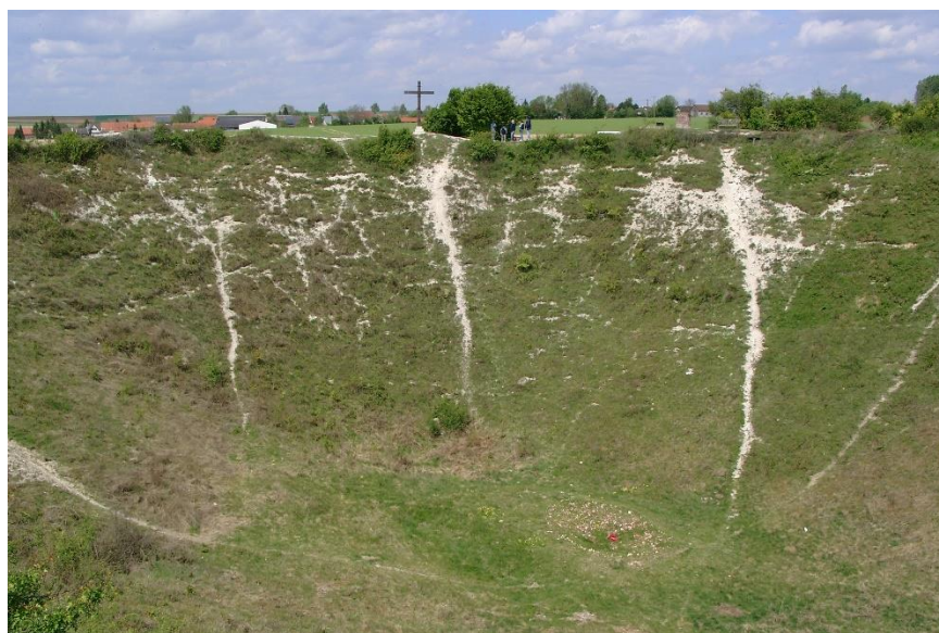
Lochnagar Crater, La Boisselle, Somme—Always a moving experience !

Day 0—Monday, 10 October—Morning departures at 9:00am to BRU We expect to arrive at the return point by 11:00am, but delays are always possible.