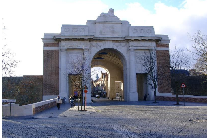
Menin Gate Memorial to the Missing, Ypres, Belgium

Knee Deep Into History... Today, Flanders Fields and the Somme battlefields of WW1 stand as symbols of the futility of WW1 trench warfare and the thousands of casualties that it produced. More important, each of these battlefields also tells the story of changing strategies, tactics and weapons too try to break out of the Western Front stalemate.