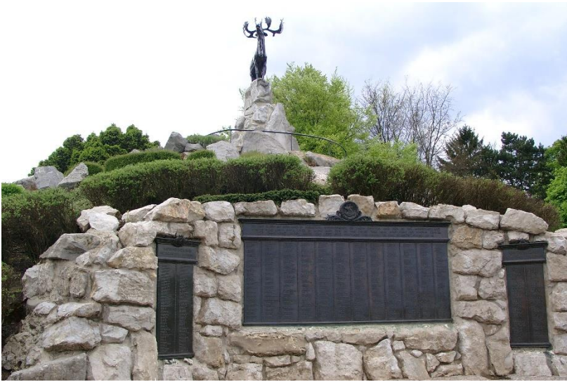
Newfoundland Memorial Park, Beaumont-Hamel, Somme