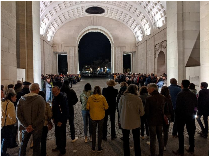
Awaiting the Last Post Ceremony at the Menin Gate, Ypres, Belgium