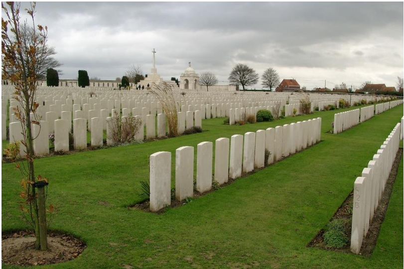
Tyne Cot Cemetery & Visitors Centre, Zonnebeke, Belgium