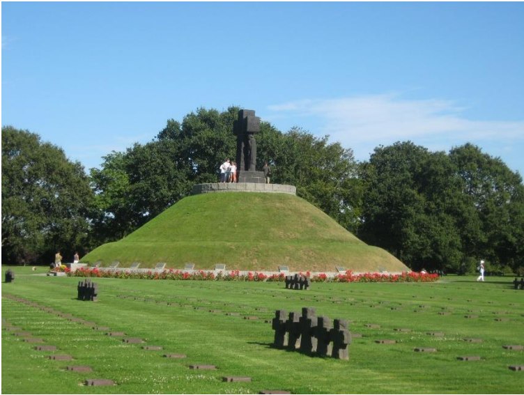
Deutscher Soldatenfriedhof La Combe