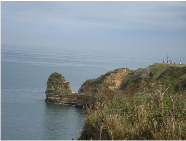
Pointe du Hoc