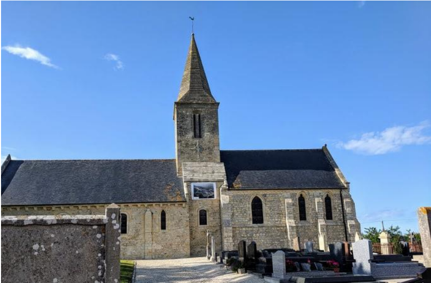
Saint-Pierre-du-Mont Church along the Normandy Coast. Once an early airfield.