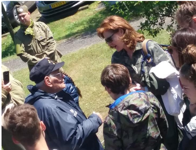
Opportunity to meet a veteran at Normandy American Cemetery, June 2019

Day 0—Monday, 12 September—Morning departures at 9:00am to CDG. We expect to arrive at the return point by 12h00, but delays are always possible.