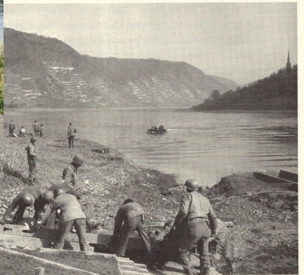
Koblenz, Germany—16 March 1945. Engineers begin construction of a bridge across the Moselle River at the site of the 347th Regiment's crossing.

Join Knee Deep Into History's "Racing Through Germany Tour" and follow in the footsteps of two of General Patton's Third Army divisions: the 87 th and 89 th Infantry Divisions. The tour's name reflects the speed of the Allied army advance through Germany after the Westwall was breached. This tour will start with the 87 th Infantry's baptism of fire in the Ardennes. It will then advance to Koblenz and to the Westwall, before crossing the Moselle and Rhine Rivers. After the river crossings it will follow the two divisions' advance across Germany to Plauen and Zwickau. The tour will end with a visit to Colditz Castle, a famous POW camp, and a day and a half in Berlin, the capital of Nazi Germany.