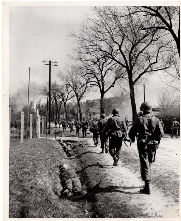
Signal Corps photo 337976 showing medics taking cover as 89 th Div. soldiers move into Arnstadt, Germany in April '45.

Questions or concerns? Contact Randy Gaulke at kneedeepintohistory@gmail.com or 908.451.0252.