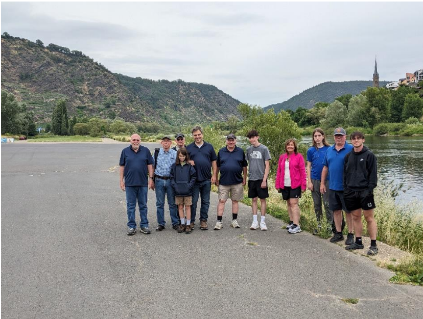
Koblenz, Germany, 87 th Inf. Div. Moselle River Crossing site during a private family tour in 2023.