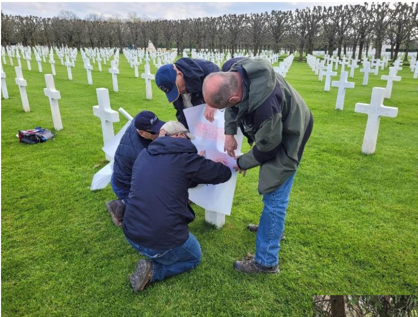
Top: Remembering the fallen takes many forms. Participants on one 2023 tour made grave rubbings of unit members who died in WW1 and are buried at the ABMC cemeteries.