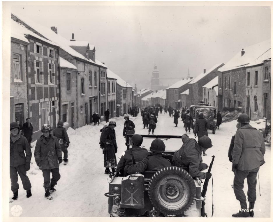
showing 87 th Division infantry entering St. Hubert, Belgium after the Germans fled