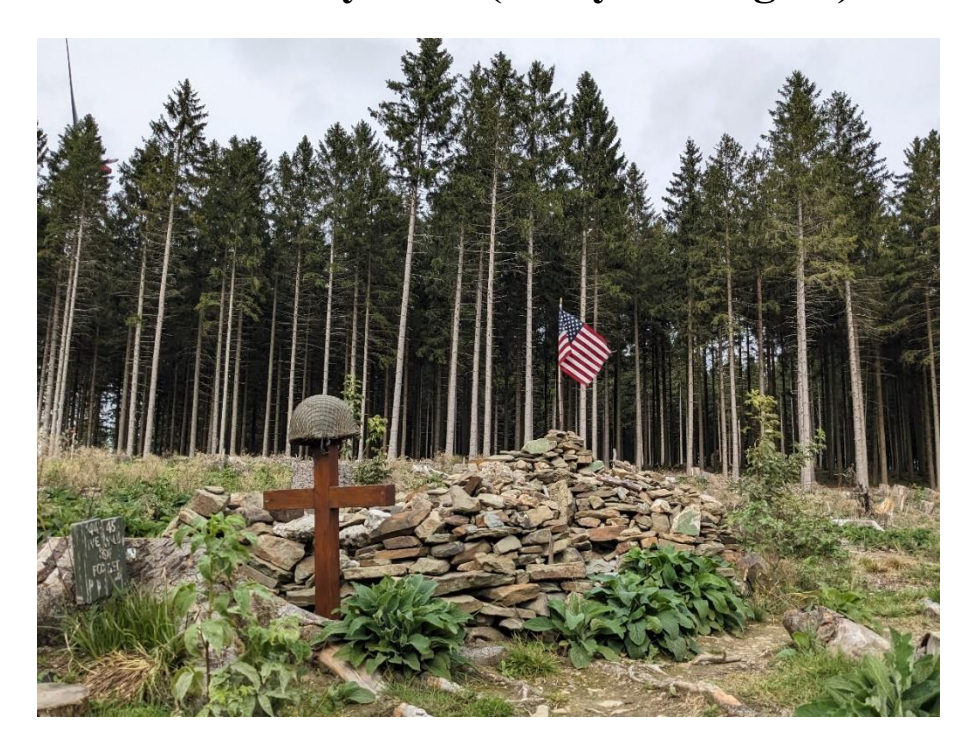
The Hürtgen Forest continues to give up its dead decades after the battle.

Get knee deep into history exploring two of the lesser-visited battles of WW2: Operation Market-Garden in the Netherlands and the Hürtgen Forest along the German-Belgian border. Both battles represented the Allied overconfidence after Germany's rapid retreat in the Summer of 1944 and both were paid for in human lives.