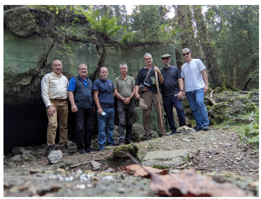
Westwall bunker situated in the Hürtgen Forest on the Ochsenkopf Trail

Day 4, Monday, 14 July: Walks in the forest, including the Ochsenkopf Trail and the Kall River Trail. We will also visit the Aachener Dom (Aachen Cathedral), a UNESCO World Heritage Site and church where numerous German kings and queens were crowned. Drive back to BRU. We anticipate arriving at BRU around 5:00pm.