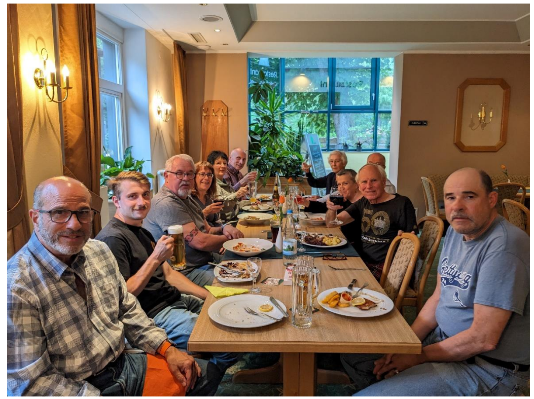
A great meal and beverages is always welcome after a day in the field.