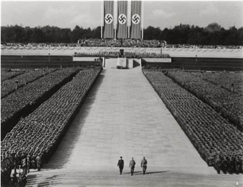
Top: Nuremberg Rally Grounds in a still from Leni Riefenstahl's Triumph des Willens.