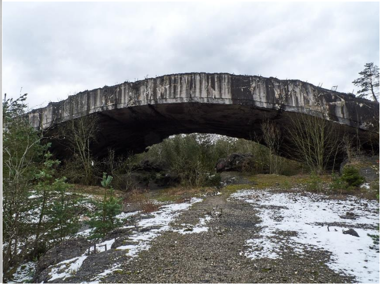
Weingut Me 262 Bunker, Mühldorf, Germany

Join KDIH on a unique tour through Bavaria and Austria, visiting key sites of the early and final years of the Third Reich. In the 12 years of Hitler's "Thousand Year Reich", vast construction projects were a staple of the regime, from monumental displays of power during the early years to megalomaniac bunkers to shield the collapsing Reich from Allied bombs. From the famous parade grounds in the "Führer City" of Nuremberg to enormous concrete bunkers housing jet fighter factories, participants will experience a combination of idyllic towns and exclusive historical places.