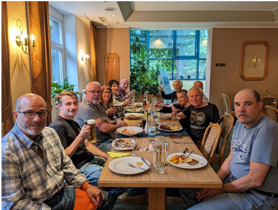
After some intensive walks, above and below ground, German beer and cuisine is a welcome treat.