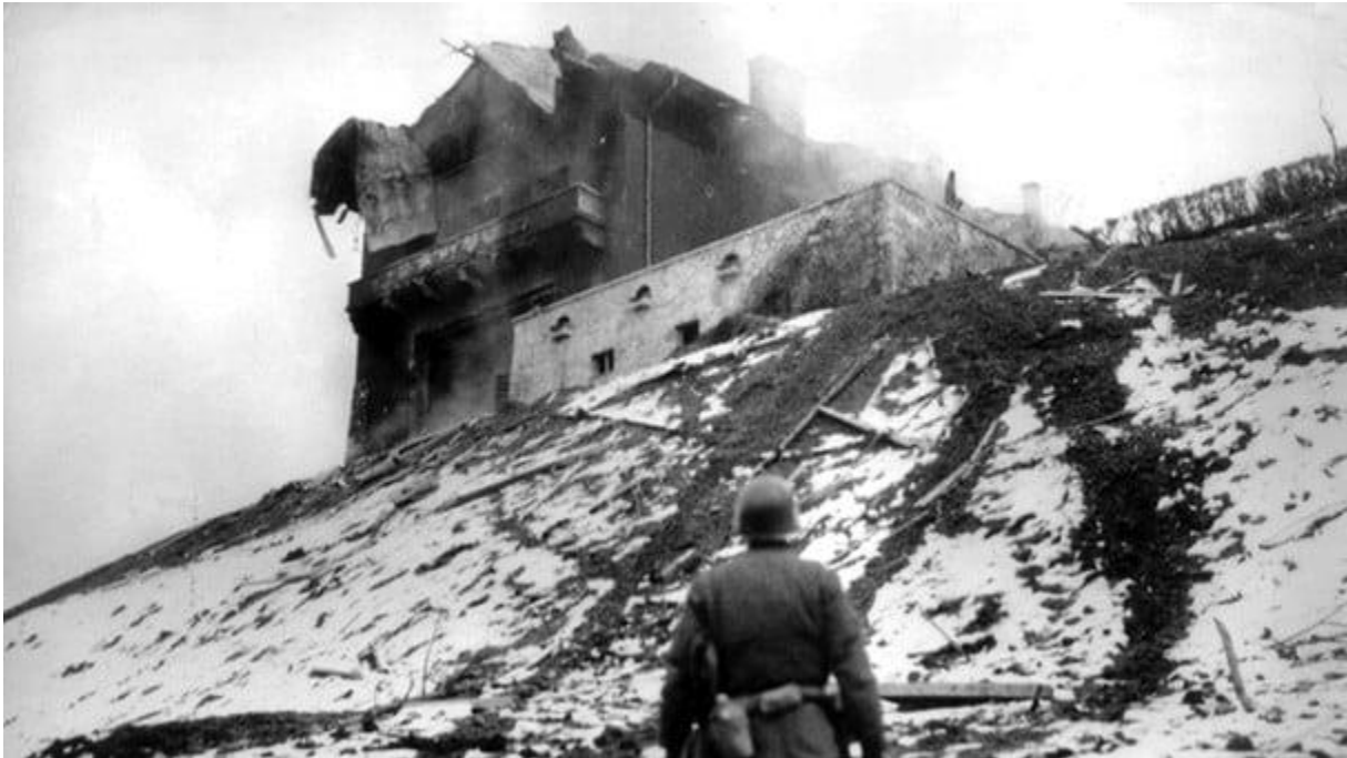
GI standing in front of the smoldering ruins of the Berghof