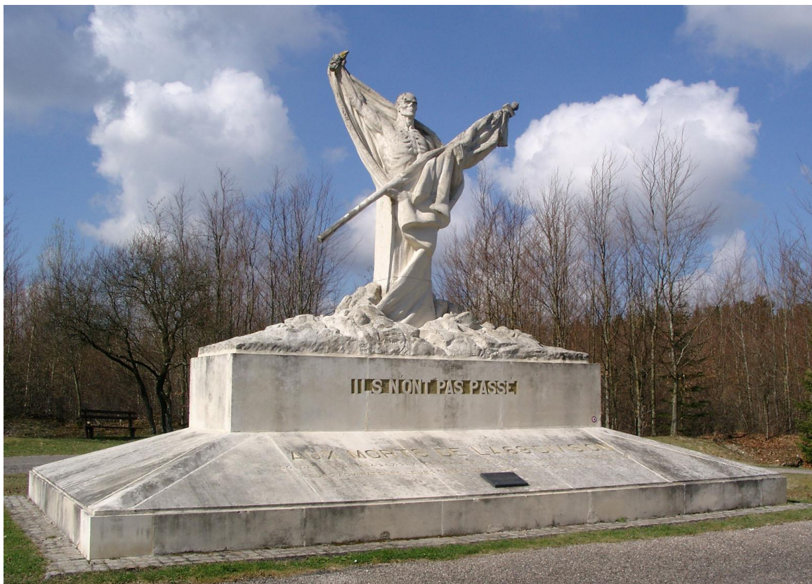
Toter Mann Memorial

Participants are responsible for their own lodging arrangements or further travel after the end of the tour. Options include: booking a hotel near the airport, booking a hotel in Paris and taking a train or taxi to the hotel, or traveling further via rental car or train.