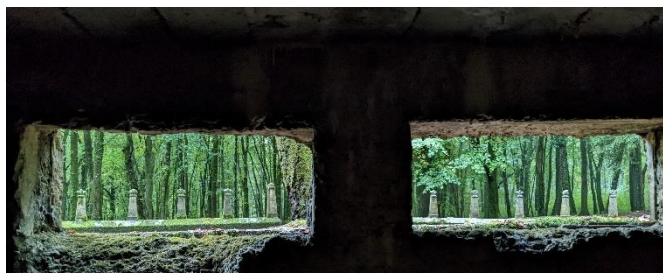
The View looking out of Col. Driant's command post in the Bois des Caures