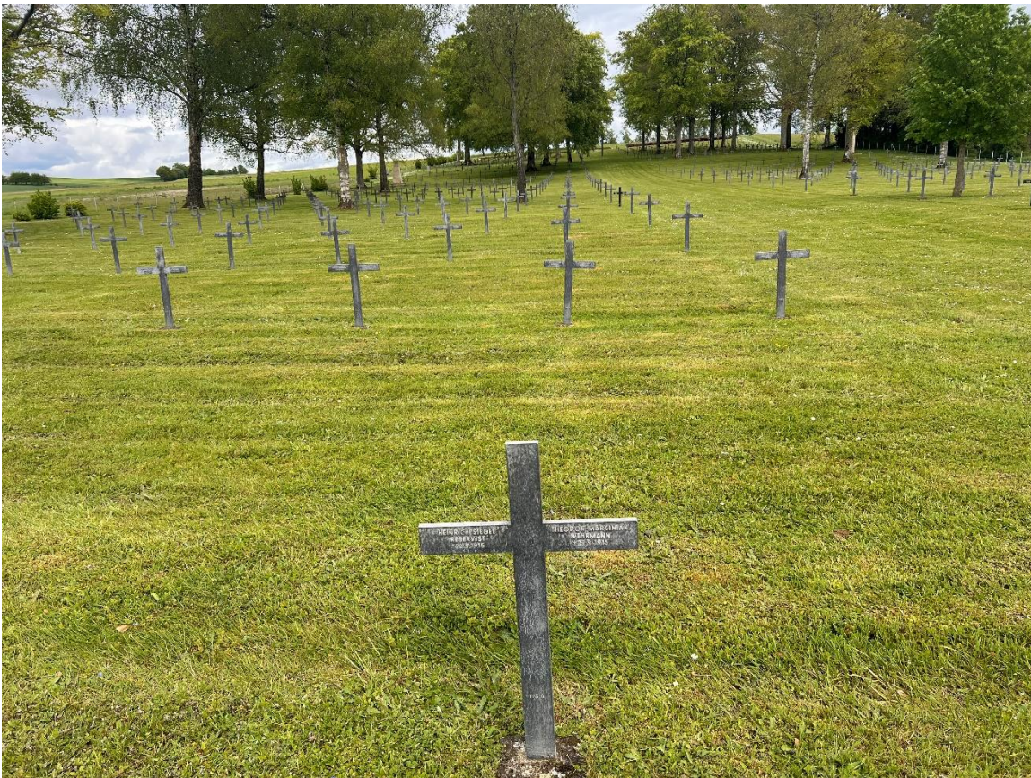
German cemetery.