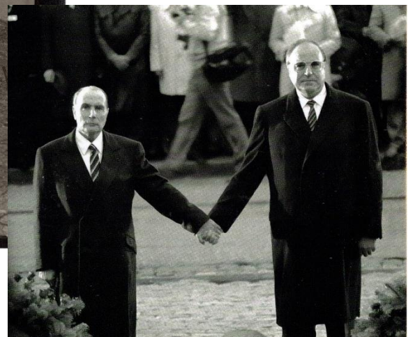
The destruction and reconciliation of Verdun in two photos.

Join Knee Deep Into History’s “They Shall Not Pass”: Verdun Tour and learn more about the war of attrition that characterized the Great War in 1916-17. For France and Germany, the battle of Verdun that began in February 1916 is synonymous with industrialized war. Hundreds of thousands of young French and German soldiers lost their lives or health during this period.