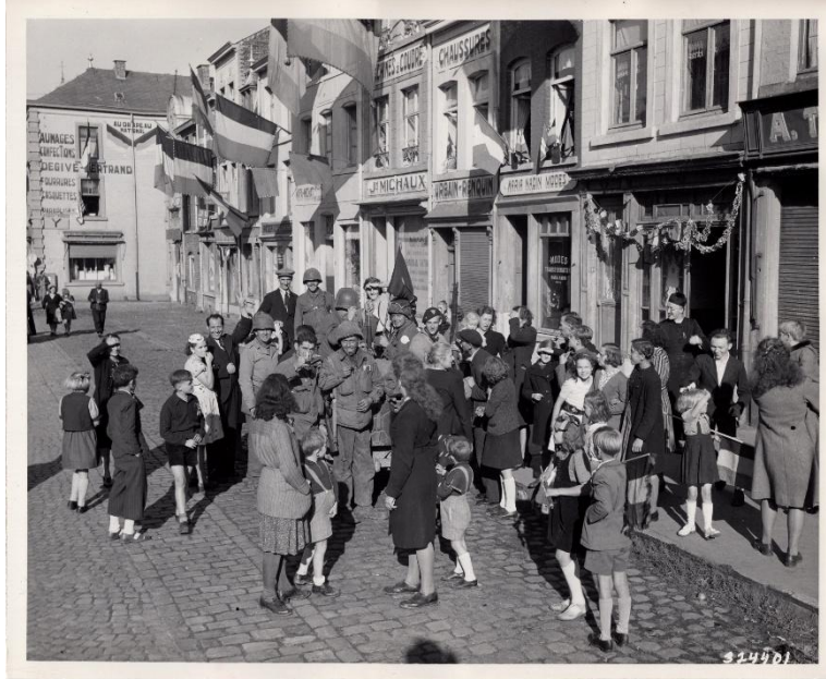
28 th Inf. Div. soldiers talk with locals in the first liberation of Bastogne, 10 September 1944

Get knee deep into history walking in the footsteps of soldiers of Pennsylvania's 28 th Infantry Division. This National Guard division faced several severe tests during its combat time in the European Theater of Operations (ETO). Landing in July 1944, the division was quickly thrown into the Normandy break-out, pushing inland south of St. Lo. Thereafter, it chased the Wehrmacht across France. In late fall 1944 it would face its two greatest challenges: First, the meat grinder known as the Battle of the Hürtgen Forest, the USA's longest and bloodiest European fight during WW2. Second, once withdrawn, the "quiet" sector of the Ardennes, just before Hitler's famous offensive on 16 December. The division would be withdrawn on 22 December; but would still see action in early 1945, helping to reduce the Colmar Pocket.