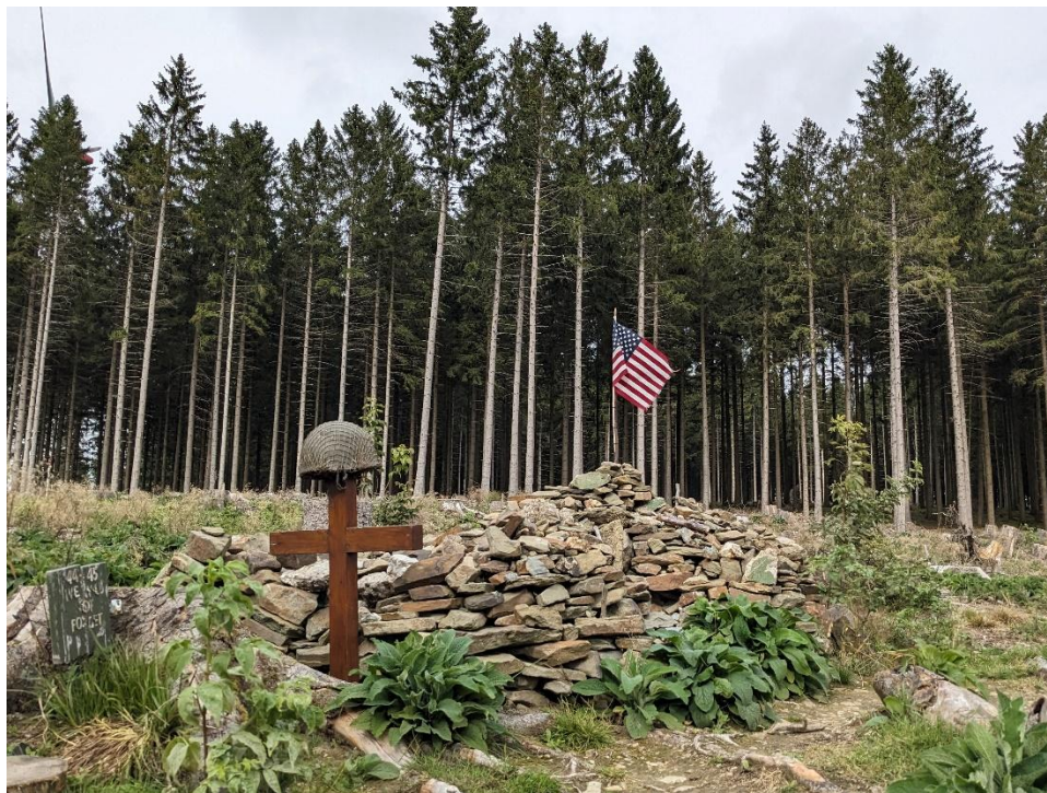
Grave marker of a fallen soldier in the Hürtgen Forest found years later