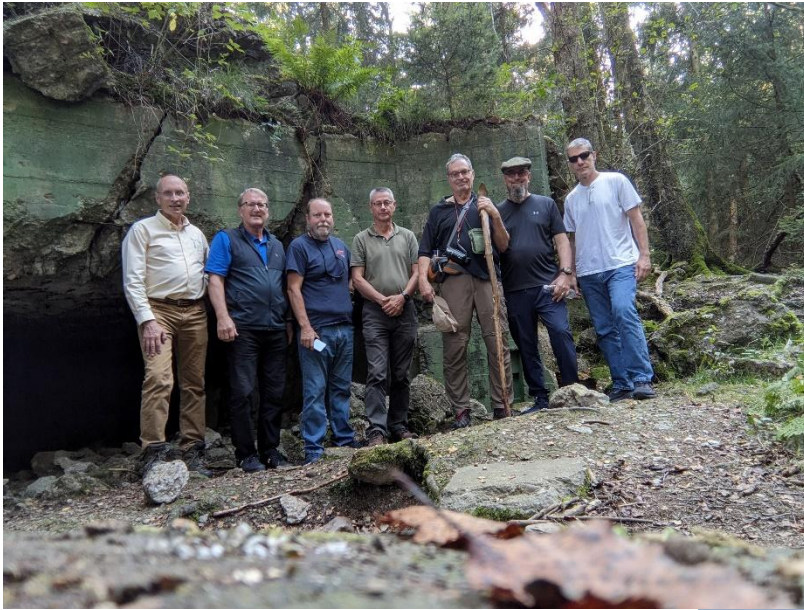
Top: Remains of a German bunker in the Hürtgen Forest.