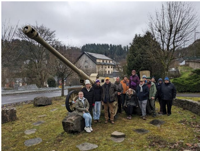
German anti-tank gun in Clervaux, Luxembourg, a key town for the division during the Battle of the Bulge