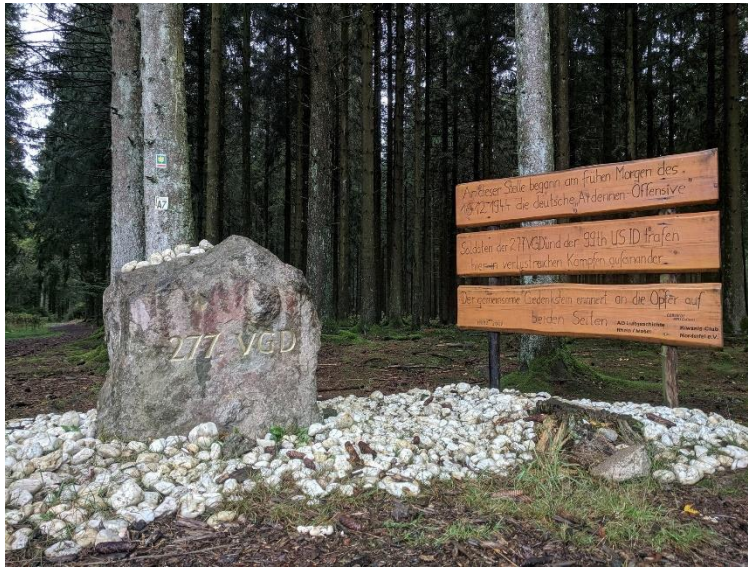
Photo of the 277 th VGD and 99 th Inf. Div. Memorial by Hollerath.

Knee Deep Into History... Hitler had decided to put all his eggs in one basket to defeat the Western Allies with one great push, the operation "Wacht am Rhein." Starting on 16 December under terrible weather conditions the German Panzer Divisions broke through the thin American frontlines. Despite a strong resistance by several American units, the German Army made its way west. The famous "Kampfgruppe Peiper" advanced under circumstances that became tragic for all.