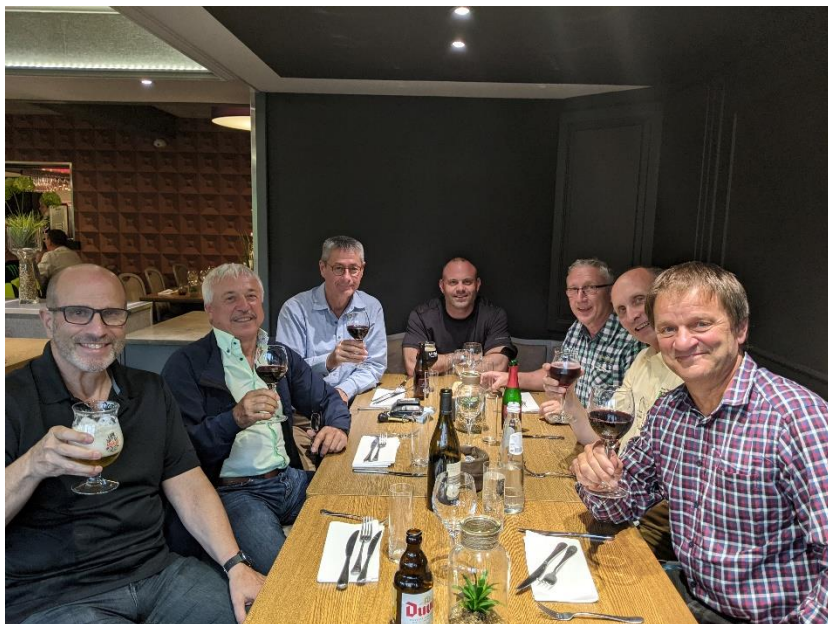
Relaxing after a day in the field