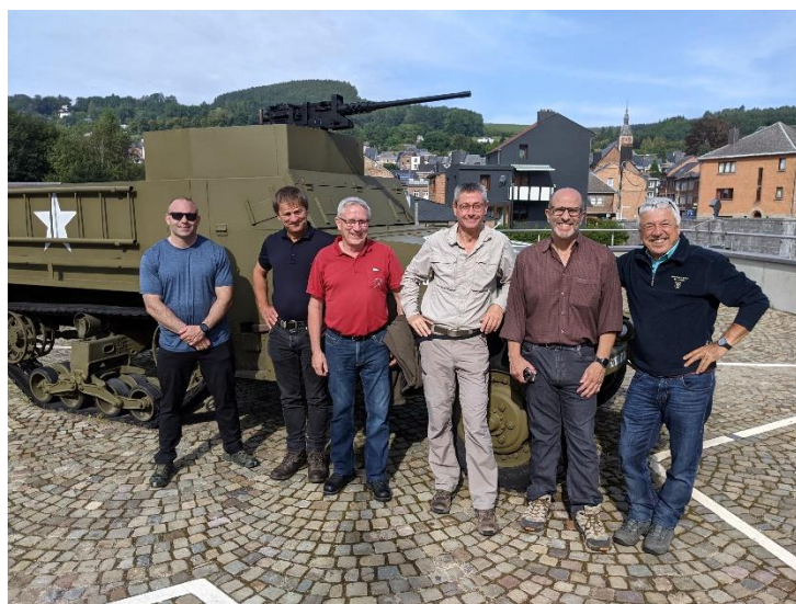
In front of the bridge over the Amblève River at Stavelot, Belgium