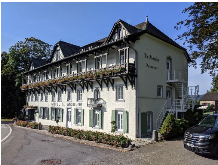
Hotel du Moulin, Ligneuville, Belgium on KG Peiper's advance route