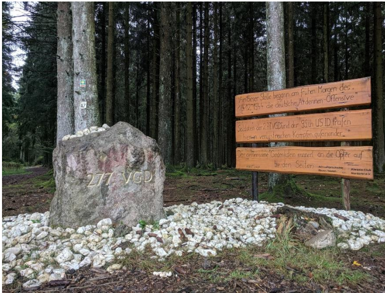
Photo of the 277 th VGD and 99 th Inf. Div. Memorial by Hollerath.

Knee Deep Into History... Hitler had decided to put all his eggs in one basket to defeat the Western Allies with one great push, the operation "Wacht am Rhein." Starting on 16 December under terrible weather conditions the German Panzer Divisions broke through the thin American frontlines. Despite a strong resistance by several American units, the German Army made its way west. The famous "Kampfgruppe Peiper" advanced under circumstances that became tragic for all.