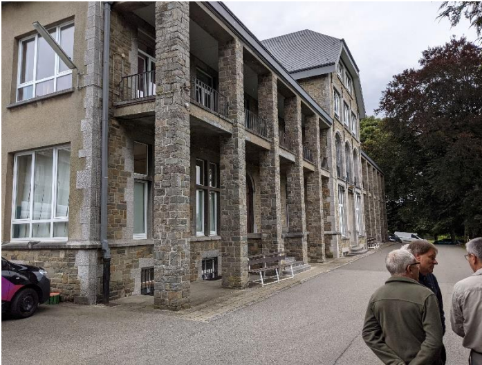
Sanatorium St. Edouard, Stoumont, scene of heavy fighting against KG Peiper