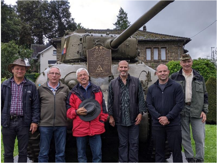
7 th Armored Division Memorial Sherman, St. Vith