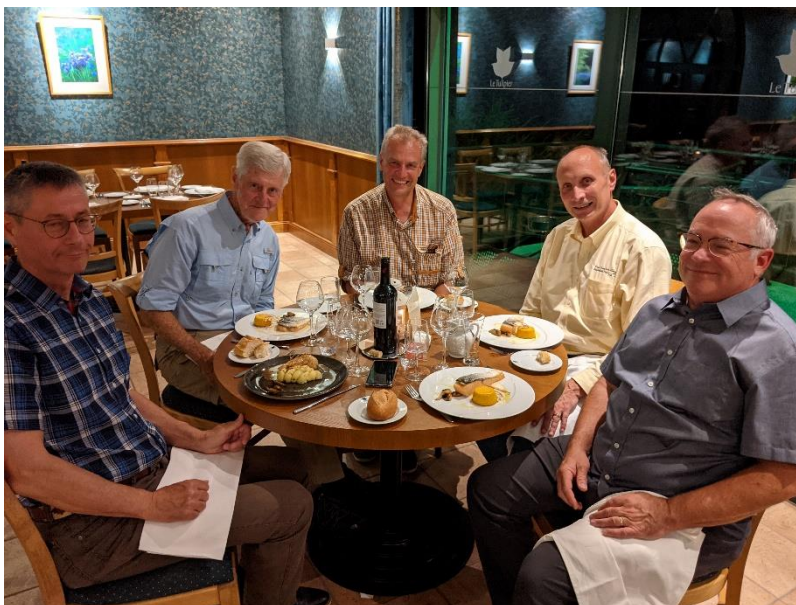
Rewarding dinner after a day in the field.

Day 0—Sunday, 5 June—Morning departure at 9:00am to CDG. We expect to arrive at the return point by 12:00pm, but delays are always possible.