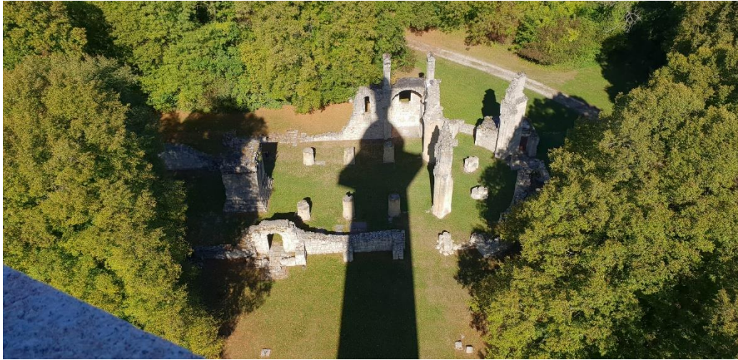
Photo of Montfaucon Memorial and Village

Knee Deep Into History... By mid-1918 the rapidly expanding but still green troops of the American Expeditionary Forces had yet to undertake an offensive as an independent American Army. But things were changing! At meetings throughout the late Spring and early Summer 1918 General Pershing continued to insist that the A.E.F. should fight as a separate American Army as soon as practical. On 24 July Pershing issued an order announcing the formation of the First American Army, effective 10 August; and in early August Generals Pershing and Foch agreed that American First Army should eliminate the St. Mihiel Salient. Accordingly, Pershing and his staff refreshed plans to attack in the St. Mihiel Salient, an objective that had been studied in 1917. The German Supreme Command had already planned a retreat from the Salient to a more defensive position, and the first German troops started moving when the offensive began.