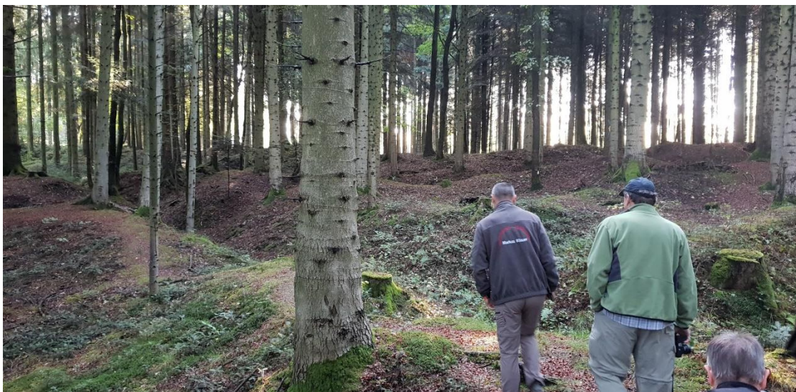
Trench remains in the Argonne Forest.