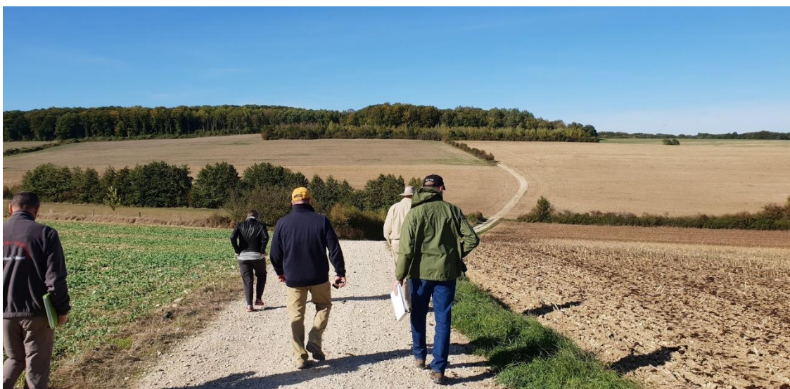
Walking from Nantillois to the Hindenburg Line.