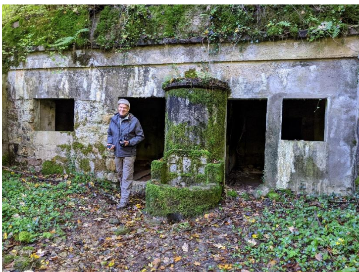
The Remains of a German Camp in the St. Mihiel Salient.