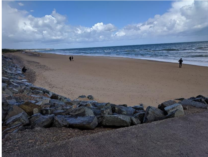
Omaha Beach 2019

D-Day / Normandy 5-Day (+2) Small Group Battlefield Tour 24 – 30 May 2022