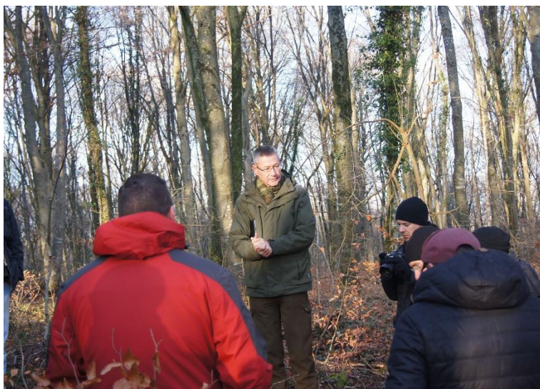
Forges forest on the West Bank of the Meuse-River