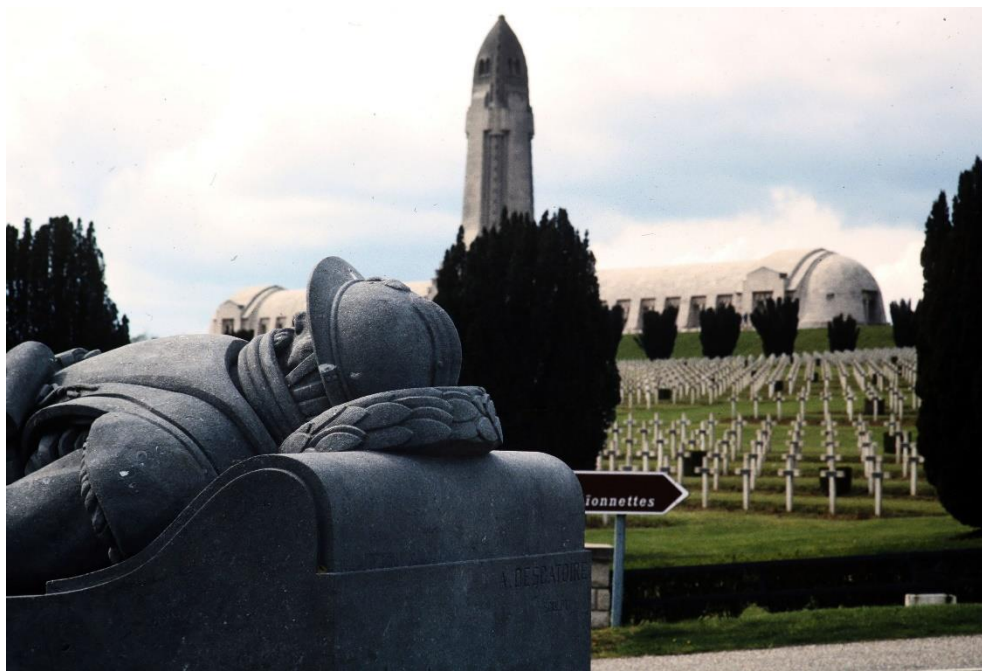
Visiting the Ossuaire de Doumont is always a moving experience!

Day 0—Wednesday, 8 June—Morning departures at 9:00am to CDG. We expect to arrive at the return point by 12h00, but delays are always possible.