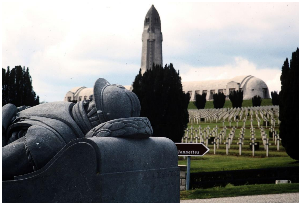
Visiting the Ossuaire de Doumont is always a moving experience!

Day 0—Wednesday, 8 June—Morning departures at 9:00am to CDG. We expect to arrive at the return point by 12h00, but delays are always possible.