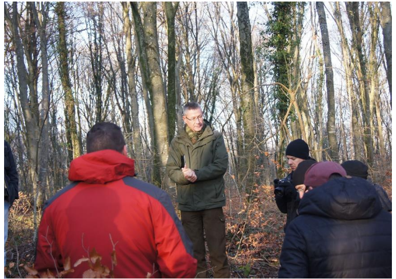
Forges forest on the West Bank of the Meuse-River