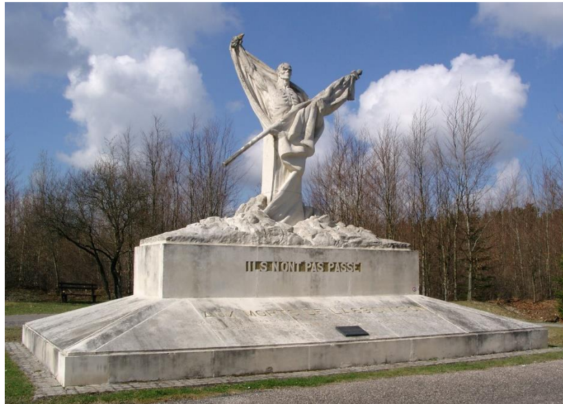
French memorial on le Mort Homme

Verdun 1916 2-Day (+2) Small Group Battlefield Tour 5 – 8 June, 2022