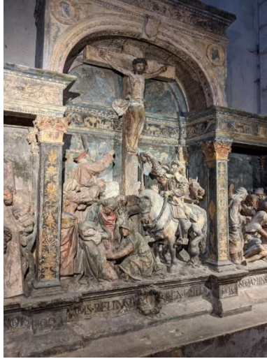
Cultural Stop in Hattonchâtel: Altar by sculptor Ligier Richier dating from 1523