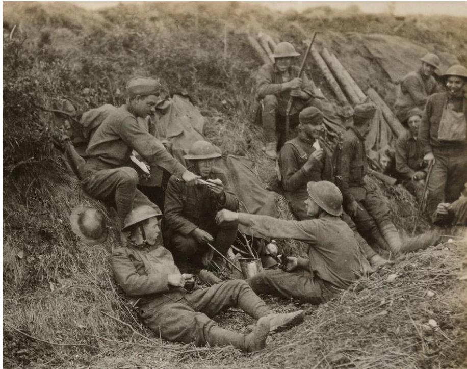
Soldiers of MG Co., 102 nd Inf., 26 th Div. having a bite to eat while entrenched along the roadside. Dated July 11, 1918.