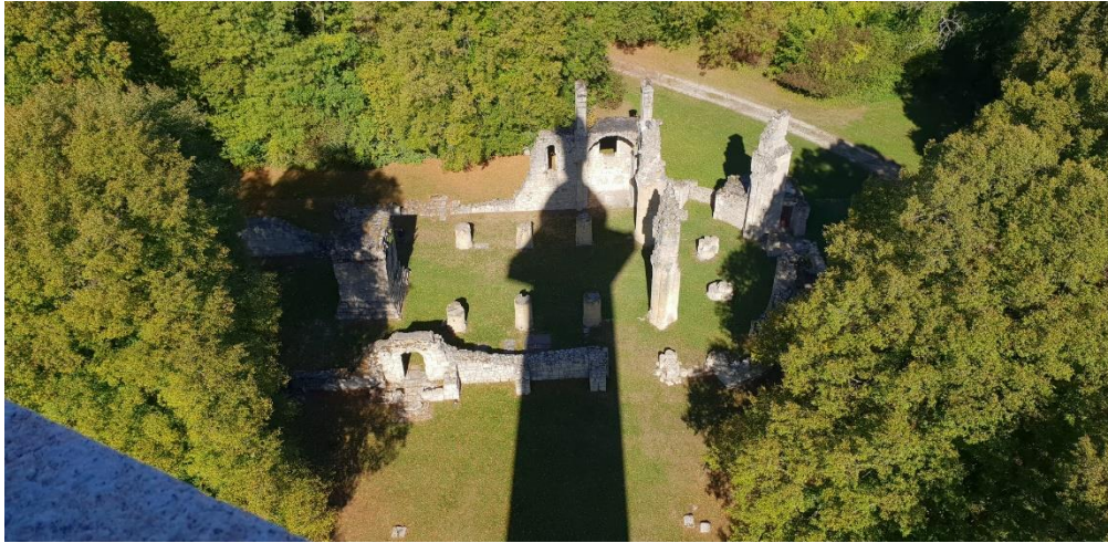
Photo of Montfaucon Memorial and Village

Knee Deep Into History... By mid-1918 the rapidly expanding but still green troops of the American Expeditionary Forces had yet to undertake an offensive as an independent American Army. But things were changing! At meetings throughout the late Spring and early Summer 1918 General Pershing continued to insist that the A.E.F. should fight as a separate American Army as soon as practical. On 24 July Pershing issued an order announcing the formation of the First American Army, effective 10 August; and in early August Generals Pershing and Foch agreed that American First Army should eliminate the St. Mihiel Salient. Accordingly, Pershing and his staff refreshed plans to attack in the St. Mihiel Salient, an objective that had been studied in 1917. The German Supreme Command had already planned a retreat from the Salient to a more defensive position, and the first German troops started moving when the offensive began.