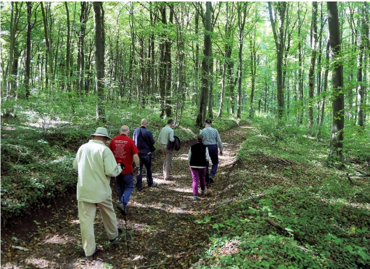
In search of traces of German positions.