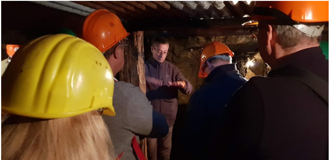
The tunnels under Vauquois.