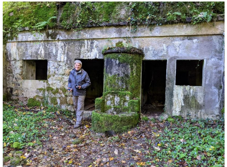
The remains of a German camp in the St. Mihiel Salient.