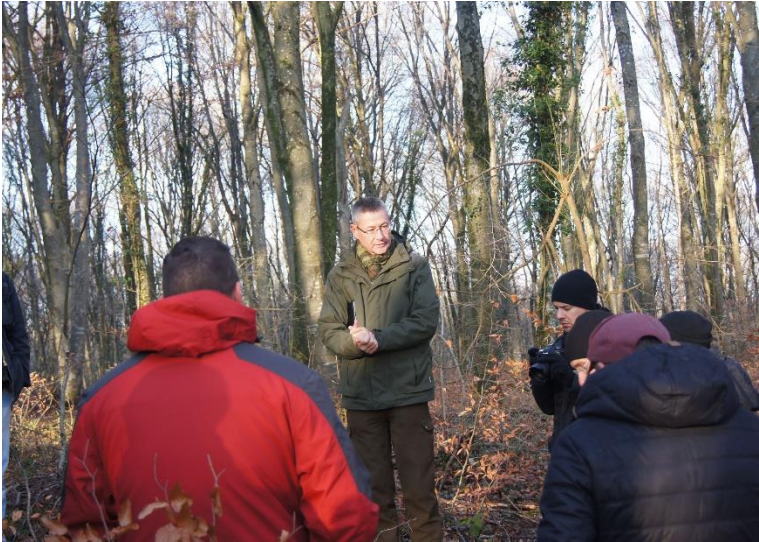
Forges Forest on the West Bank of the Meuse River