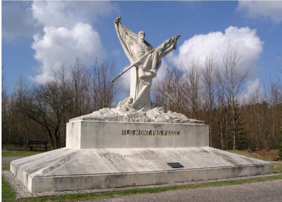
French memorial on le Mort Homme

Verdun 1916 4-Day / 3-Night Small Group Battlefield Tour 23 – 26 May 2023