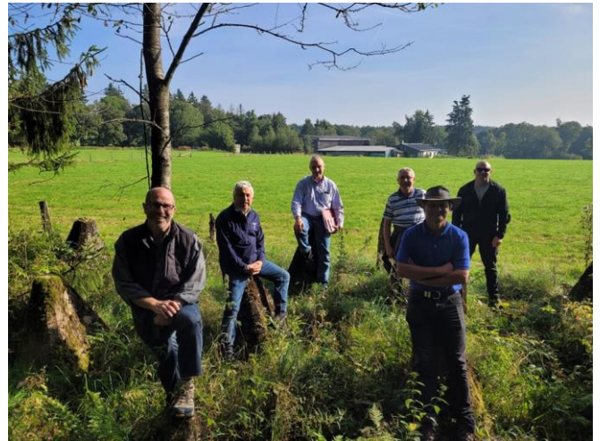
2021 Ardennes Tour participants posing on German dragon's teeth anti-tank installations.