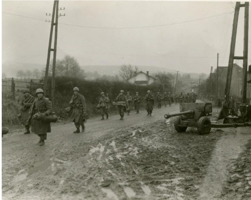
Troops of the 504 th PIR, 82 nd Airborne Div. going into the line at Cheneux, 22 December 1944

The American GI 80 th Anniversary: Normandy to the Ardennes Small Group Battlefield Tour 22 – 30 July 2024 (9-days / 8-nights)