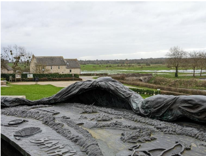
La Fiere Farm, along the Merderet River, was the site of key Airborne battles.