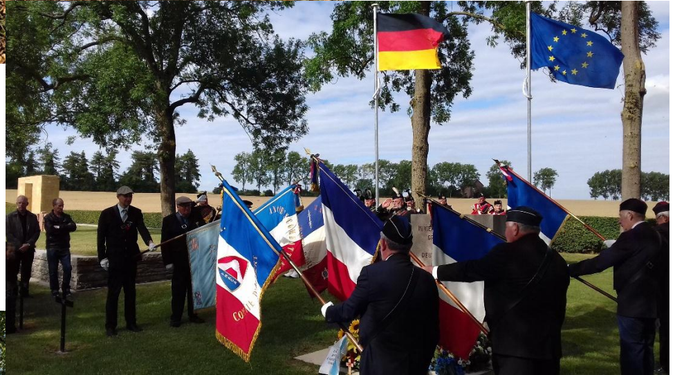
Bottom: One of the scores of Commonwealth cemeteries dotting the landscape of the Somme.