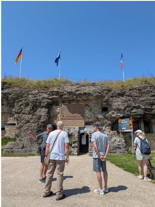
Photo of Fort Douaumont

110 th Anniversary of Verdun and the Somme Small Group Battlefield Tour 28 June – 2 July (5-days / 4-nights)