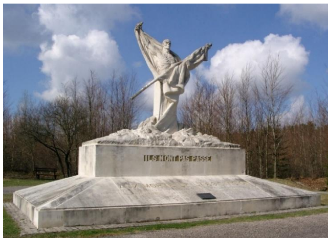
Toter Mann / Mort Homme Memorial

Participants are responsible for their own lodging arrangements or further travel after the end of the tour. Options include: booking a hotel near the airport, booking a hotel in Paris and taking a train or taxi to the hotel, or traveling further via rental car or train.