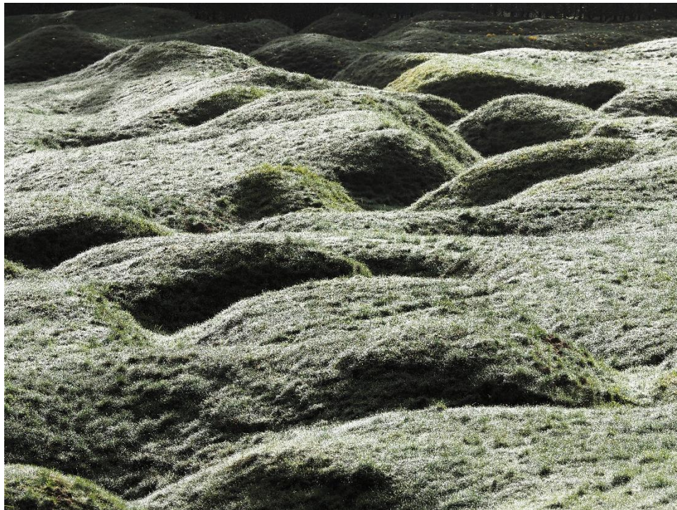
Trench remains at Beaumont Hamel Newfoundland Memorial Park.